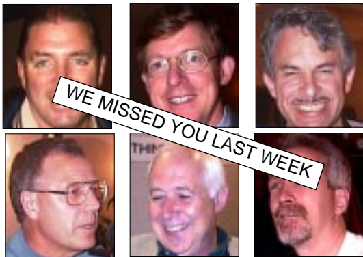
October 18, 2000